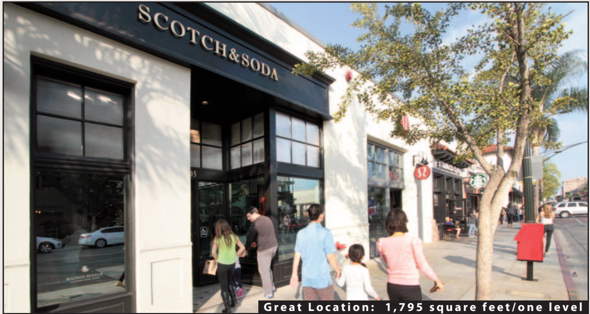
Great Location: 1,795 square feet/one level