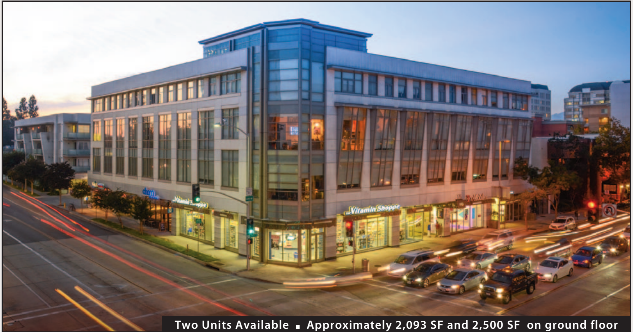
Two Units Available ■ Approximately 2,093 SF and 2,500 SF on ground floor