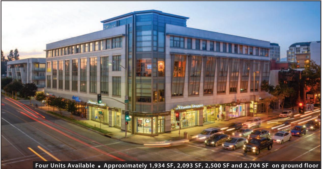
Four Units Available ■ Approximately 1,934 SF, 2,093 SF, 2,500 SF and 2,704 SF on ground floor