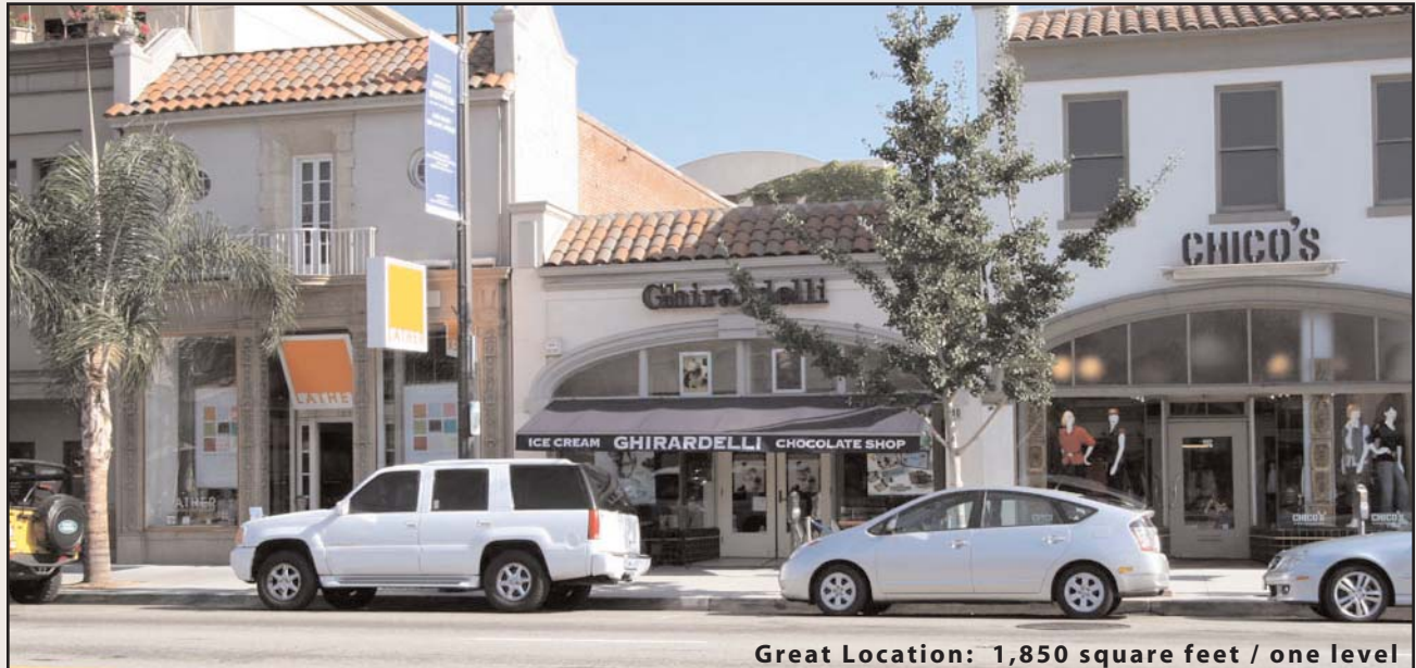
Great Location: 1,850 square feet / one level