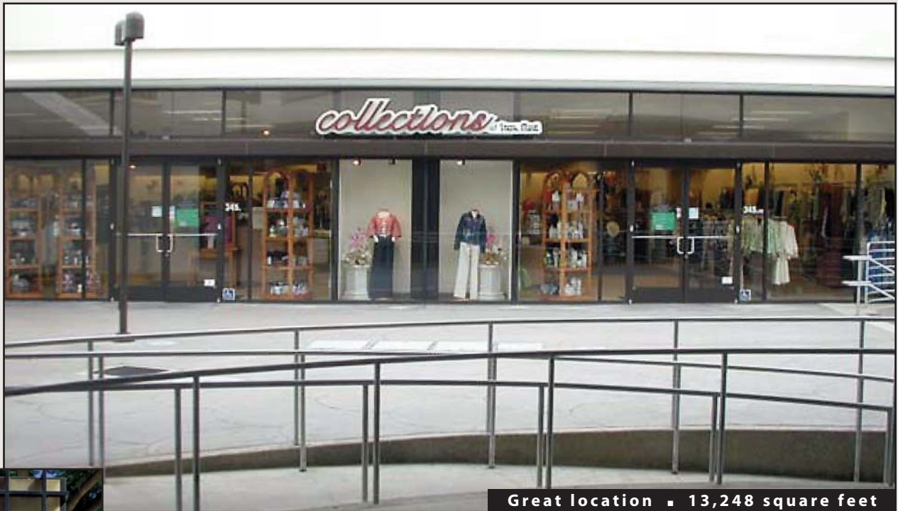
Great location ■ 13,248 square feet